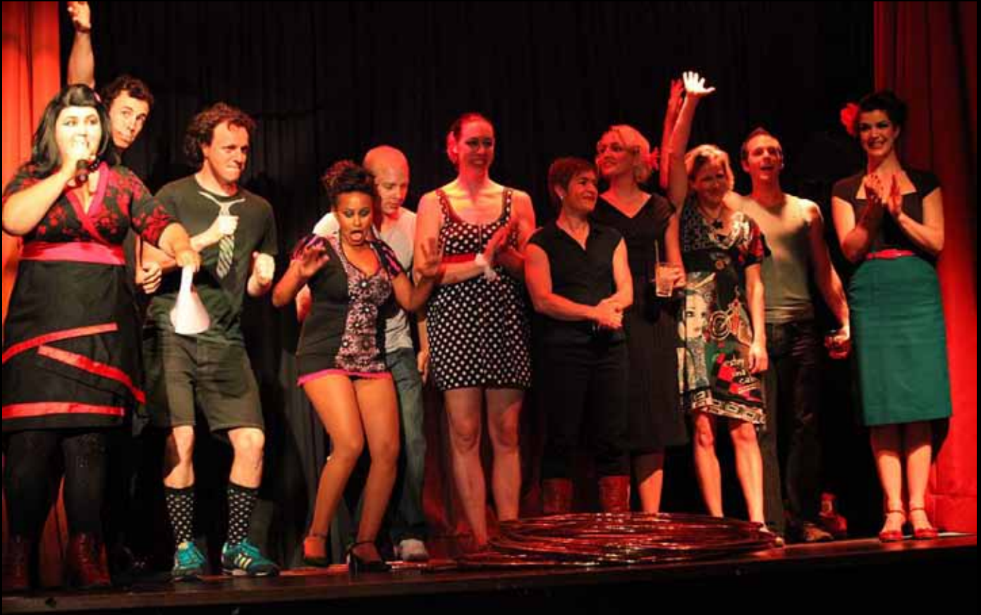
Image: Curtain Call Circus FloodAid