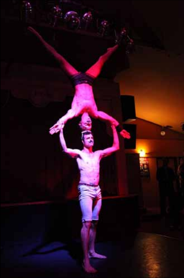
Image: Miss Ellaneous Circus FloodAid